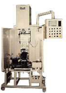
2 tons (20 Kilo Newton) Electrical Screw press machine